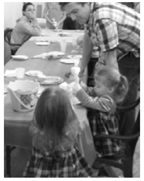
Decorating Easter Cookies