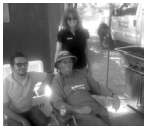
Suburban Propane manning the grill