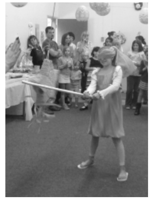
Wacking the Pinata