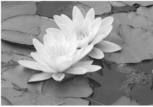
Water lilies, LML