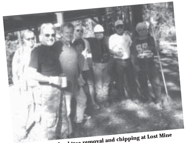
Residents who helped tree removal and chipping at Lost Mine Lake.