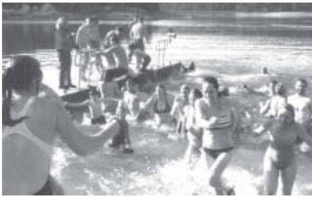
Residents emerge from Scott's Flat Lake's freezing water after the annual New Year's day polar bear plunge.