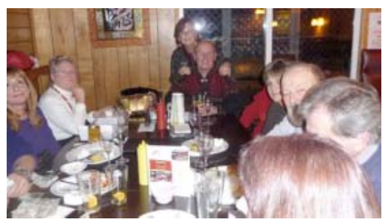
Board of Directors at The Northridge.

A: We noticed a fall-off of attendance, and we were getting stuck with unsold food. Those dinners were a successful model for at least twenty-five years, especially when we were a community of older adults with second homes. With our profile shifting to younger adults with kids, we've been experimenting with family-centered activities at the lake.