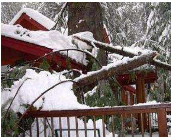
So many trees fell, including the ones pictured here. These fell on and near a Cascade Shores home, and it wasn't